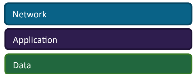
Figure 1 - Conceptual EMR System Layers

EMR data exchange covers many different use cases, and therefore EMR Offerings have to be able to support different approaches to transmit data (e.g., networking protocols like HTTP and FTP, different interface approaches like Web Services and RESTful APIs, etc.), different approaches to transforming and encrypting data, and persisting data in different formats (e.g., different data models and physical database structures, different storage formats such as free text and coded values, different file types such as PDF and JPEG).